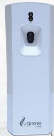
Automatic Air freshener Dispensers