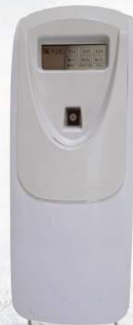
Automatic Air freshener Dispenser