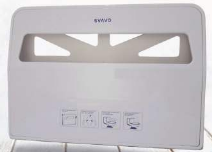
Toilet seat cover dispenser

This eliminates manual air fresheners and especially now in the Covid infections era due to the contact by many users, the automatic air fresheners are ideal for this purpose as they prevent germs transfer between users. The air fresheners are powered by alkaline batteries and the unit settings are fully customized using the digital interface. The dispenser sprays fragrance out of the interval and this can be customized as per the customer needs.