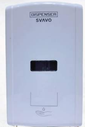
Hand sanitizer dispenser